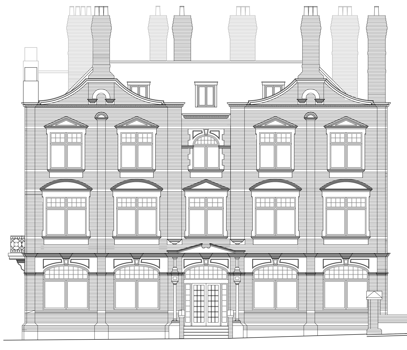
Side Elevation - Broadway