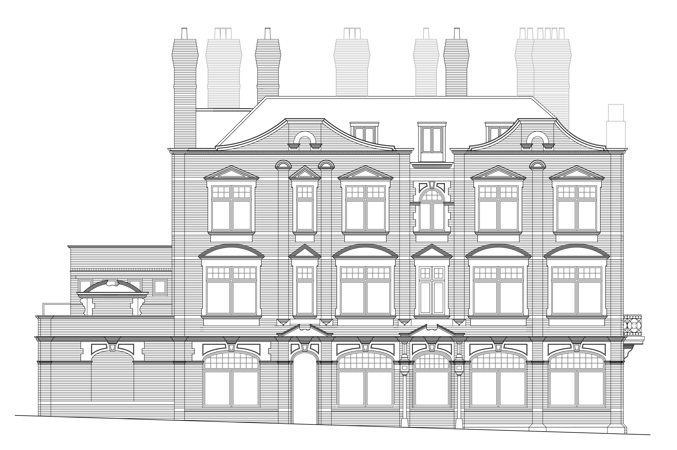
Side Elevation - Leighton Avenue